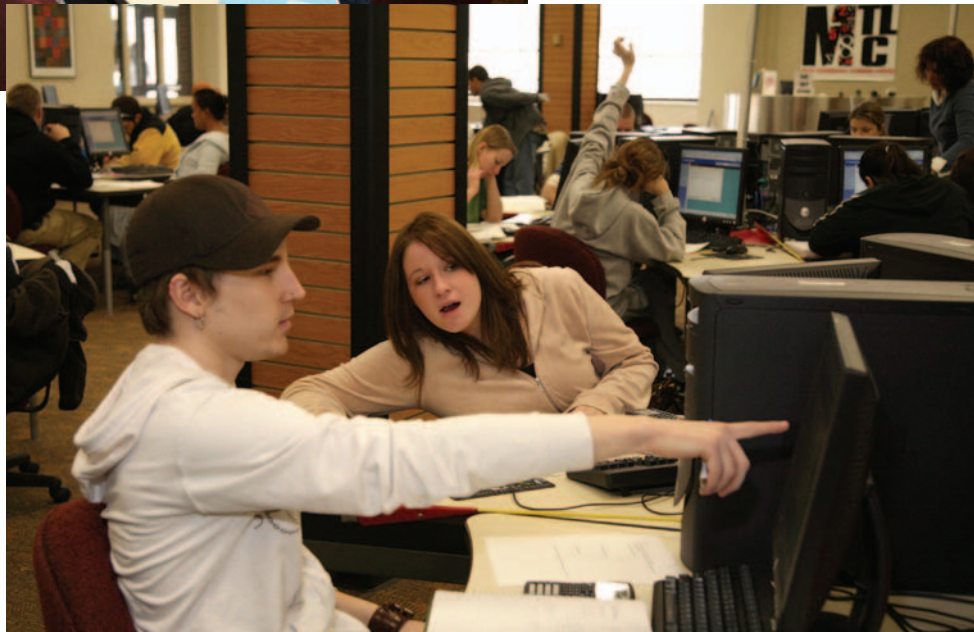
Students collaborate in the MTLC at the University of Missouri–St. Louis.

There is some tendency to confuse technology-enhanced learning—such as online tutorials, homework, and quizzes—with online courses in which